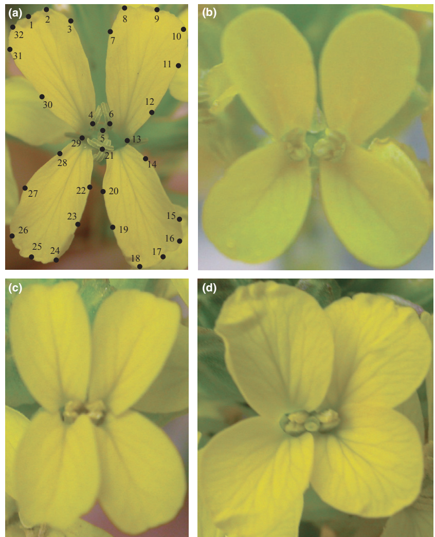
Fig. 1 Floral shape diversity in a wild population of Erysimum mediohispanicum (Brassicaceae). (a) Example of a flower that is almost perfectly symmetric about both the left–right and adaxial–abaxial axes. The configuration of landmarks used in the analysis is also shown. (b) Example of a flower with adaxial–abaxial asymmetry that is symmetric in the left–right direction (zygomorphy). (c) Example of a flower with left–right asymmetry, but with little adaxial–abaxial asymmetry. (d) Example of a completely asymmetric flower, both in the adaxial–abaxial and left–right directions.

In geometry, symmetry is defined as invariance under specific transformations (Weyl, 1952; Armstrong, 1988). Examples of transformations of this kind are reflection about a line or plane (from an object to its mirror image) or rotation by an angle that is an integer fraction of 360^\circ (e.g. 90^\circ or 180^\circ ). Another example of a transformation is the identity, which leaves the object unchanged (it is equivalent to two successive reflections about the same axis or a rotation by 360^\circ ). An object is considered symmetric if it remains the same after a transformation has been applied to it. The object's symmetry can be characterized by the set of transformations that leave it unchanged in this manner. These transformations are called symmetry transformations. For instance, zygomorphic flowers are symmetric under two transformations: reflection about the median plane and the identity. Disymmetric flowers are symmetric under reflections about two perpendicular axes, their combination (a rotation by 180^\circ ) and the identity. Equivalently, disymmetry can be defined by a reflection about one axis and a rotation by 180^\circ , their combination (a reflection about the perpendicular axis) and the identity (Fig. 2).